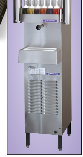
E257 Floor Model